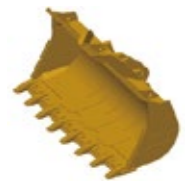
XCMG approved attachments