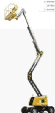
Aerial work platforms